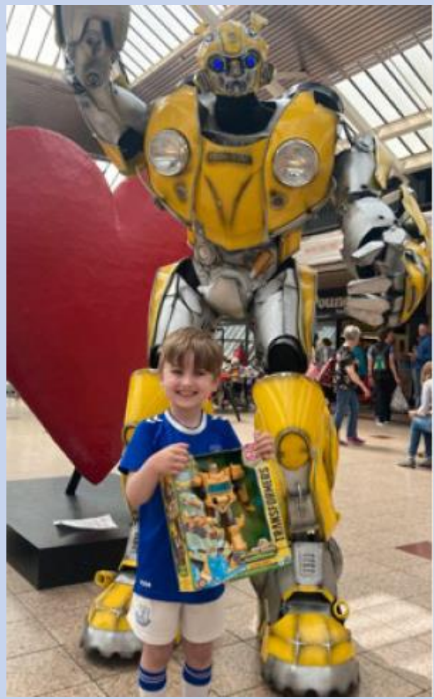
The Strand: A shopping centre at the heart of community change